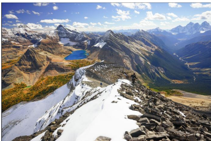
Tricia enjoying the world class views near Lake O'Hara

I first came to know Yoho in a visit to Lake O'Hara on a cold fall day in 2017, when the larch trees were turning bright yellow and shining in the sun.